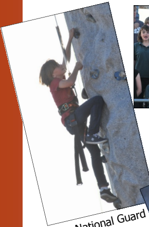
AZ Army National Guard Climbing Wall