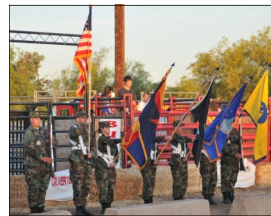
Buckeye Union High School ROTC Flag Presentation