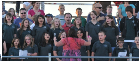
The Odyssey Preparatory Academy Choir sang the National Anthem